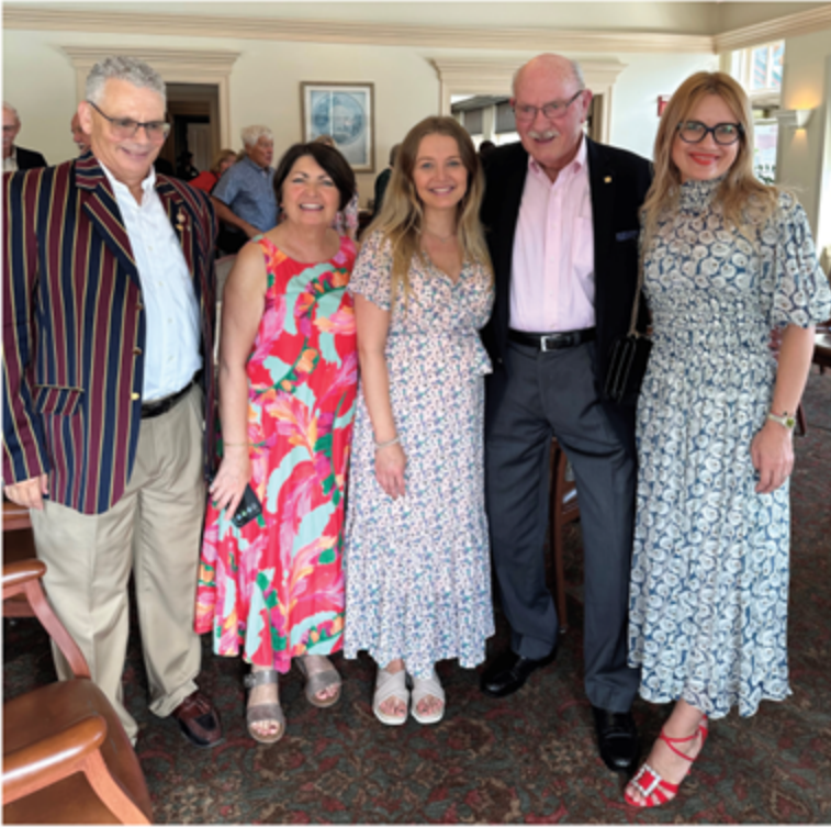
Posted by Julie Bond October 1, 2023