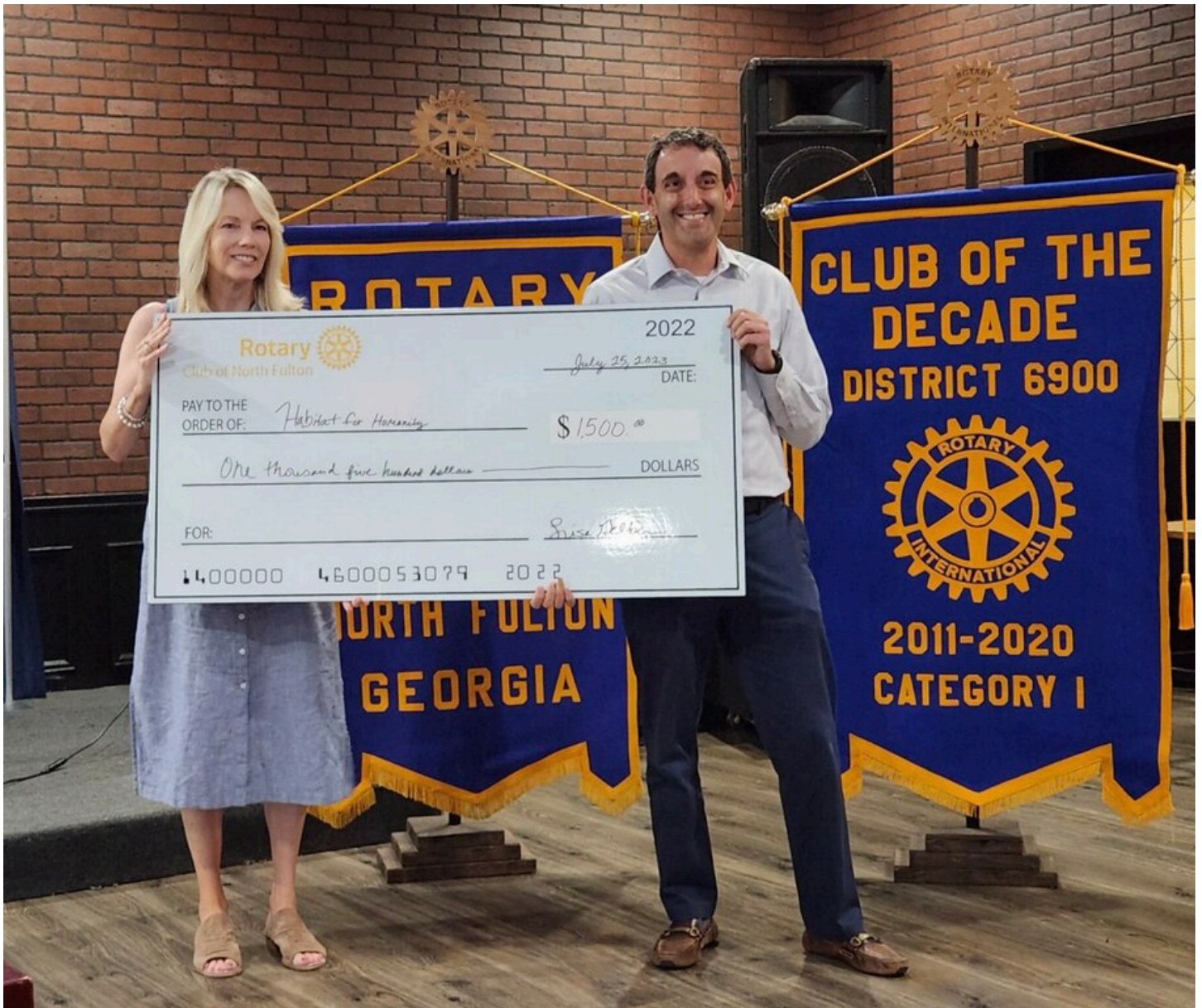
Posted by Lisa Gelber October 1, 2023