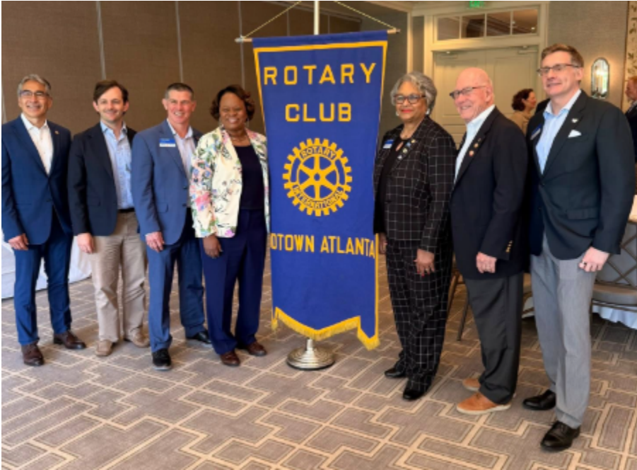
Midtown Atlanta RC celebrates 70 years of service