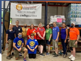
Peachtree City packed over 800 bags of canned goods to be distributed to more than 300 agencies