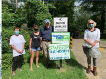
North Atlanta recently joined "Sweep the Hoop" - No trash Saturday" at the Proctor Creek site