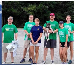
Carrollton Dawnbreakers join Great Carrollton Greenbelt Cleanup!