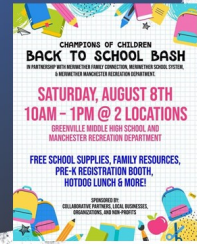
Meriwether County supports Back to School Bash