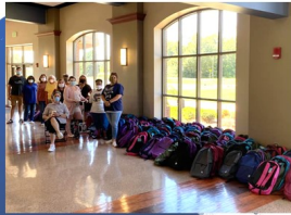
Barnesville helping fill school bags