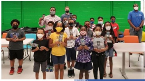
Columbus Rotary and Greater Columbus Rotaract donate 150 earphones with microphones to assist with distraction free virtual learning (thanks Joe Young)