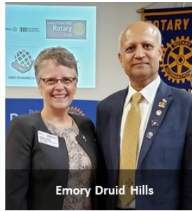
Emory Druid Hills