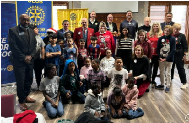
South Cobb Rotary Christmas