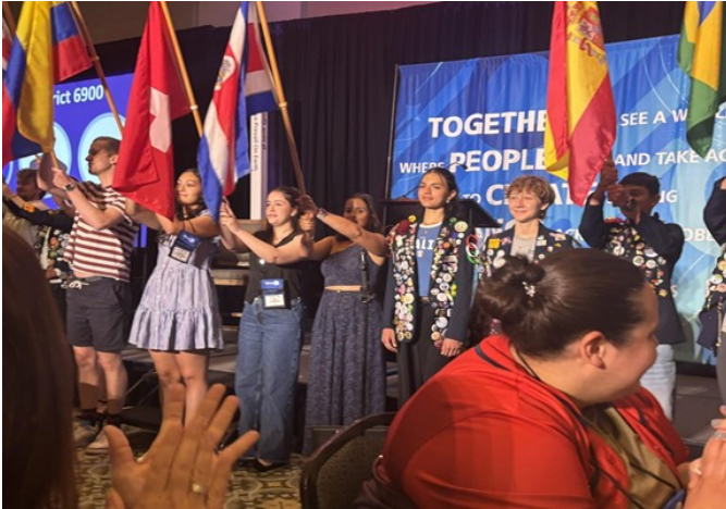
GRSP carries on tradition of presenting their flags