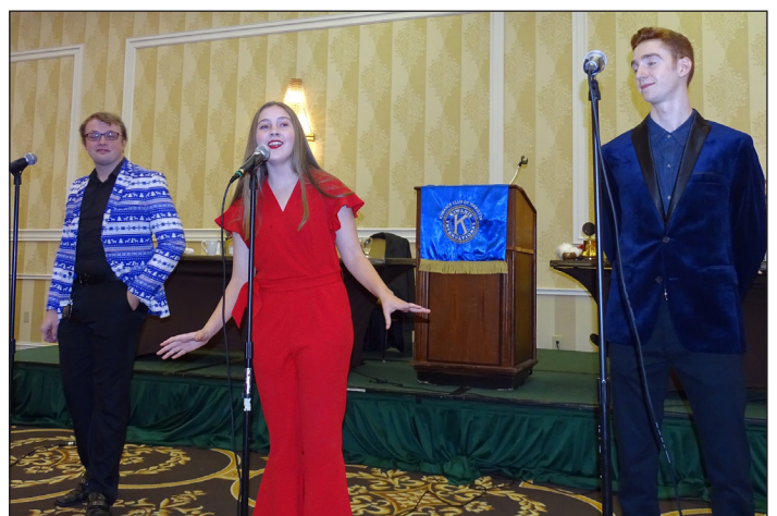
THE STRAND THEATRE SINGERS