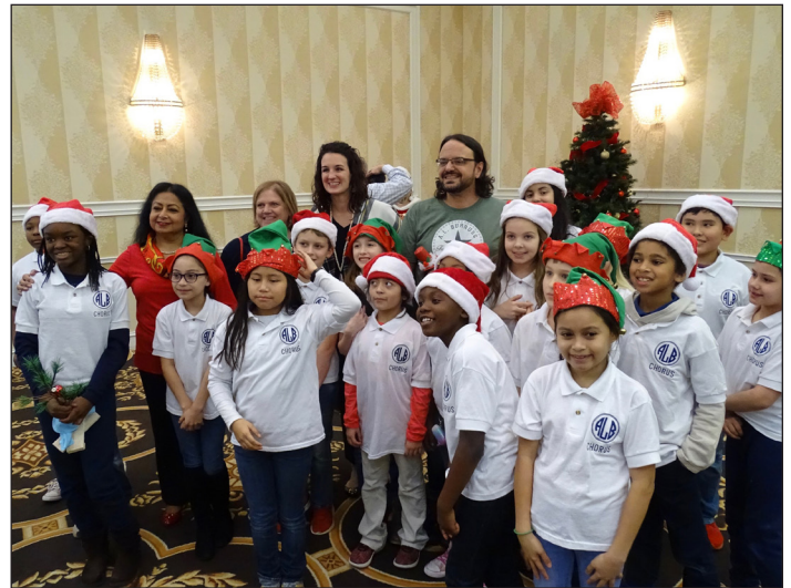
THE A.L. BURRUSS ELEMENTARY SCHOOL CHOIR