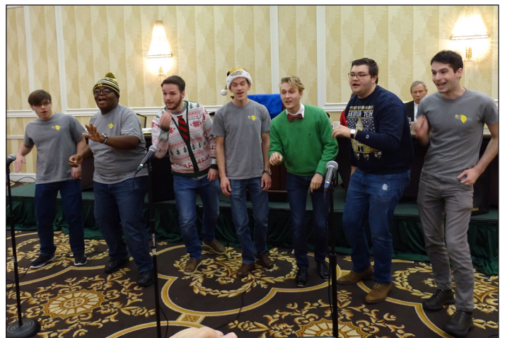
THE GEORGIA TECH GLEE CLUB