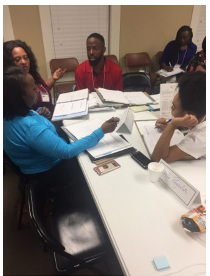
Posted by Carol Jones December 3, 2020