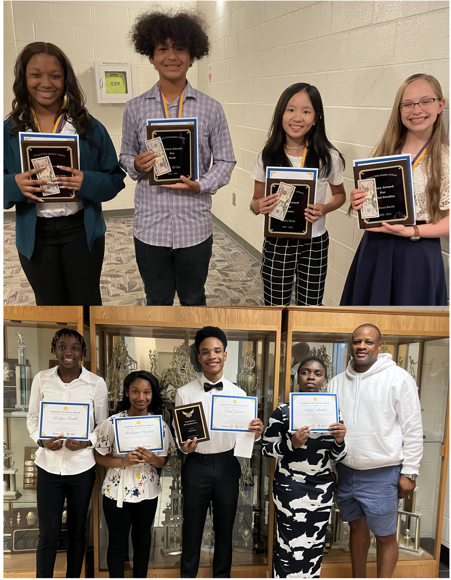
Posted by Nell Boggs