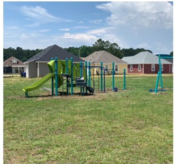
Posted by Jackie Cuthbert July 6, 2021